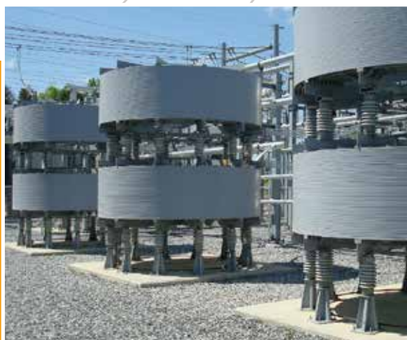
Thyristor-Controlled Reactors (USA)