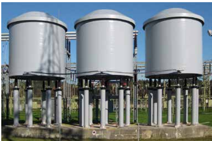
30 kV Low-Noise Shunt Reactors (Austria)

Innovation and quality are the key elements of the Coil Innovation strategy as evidenced by its advanced reactor design process and revolutionary, patented winding production technology. To achieve precise reactor design dimensions, an "online" feedback loop has been integrated into the winding process which monitors the actual wound length of each winding layer while adjusting the conductor dimensions in real-time. The results are extremely low inductance tolerances and an optimum current and temperature distribution in each of the individual parallel winding layers.