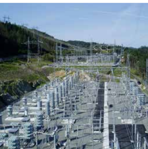
AC Harmonic Filter Reactors (Norway)

We live environmental protection throughout our company.