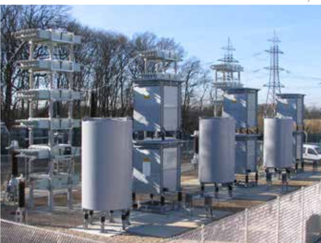
AC-Filter Reactors in the 225 kV Transmission System (France)