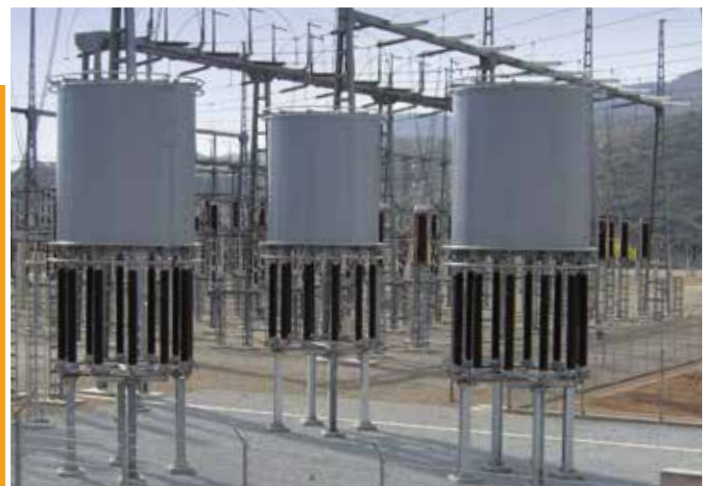
225 kV Flow Reactors (Portugal)