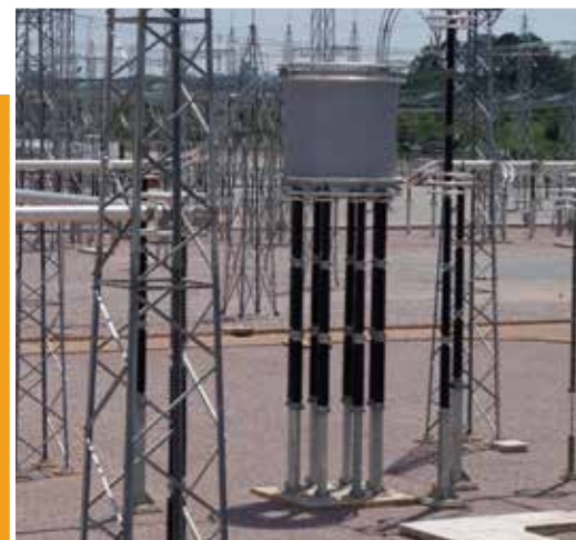
600 kV HVDC Smoothing Reactor (Brazil)