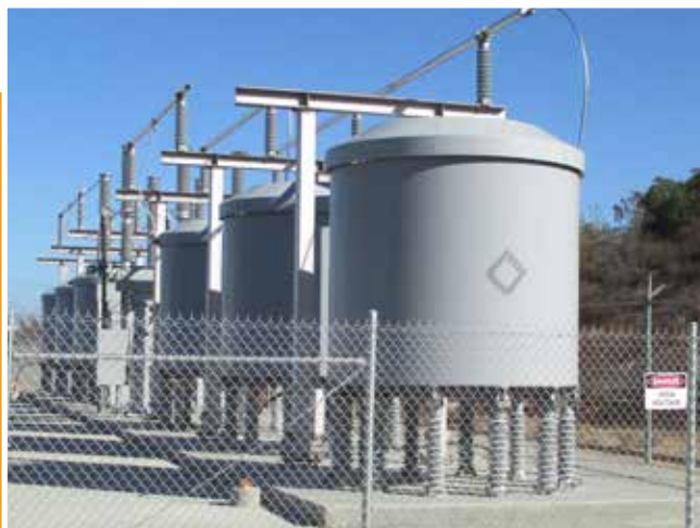
69 kV Shunt Reactors (USA)