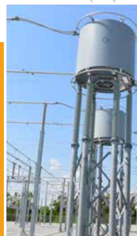
230 kV Current Limiting Reactors