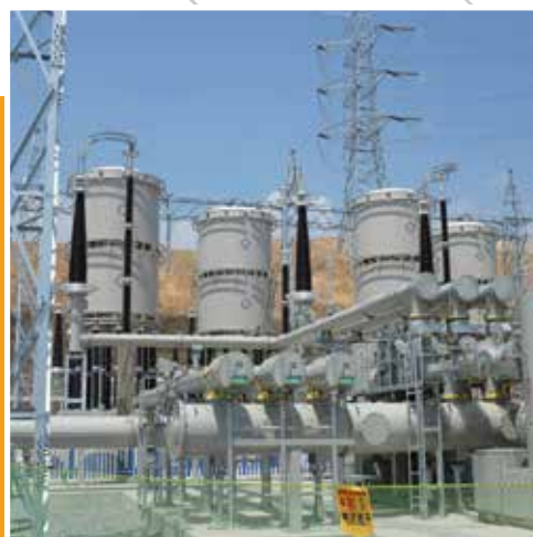
345 kV Current Limiting Reactors (South Korea)