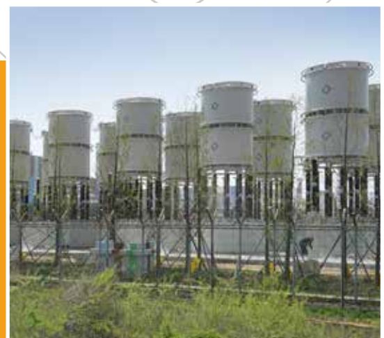
345 kV Current Limiting Reactors (South Korea)