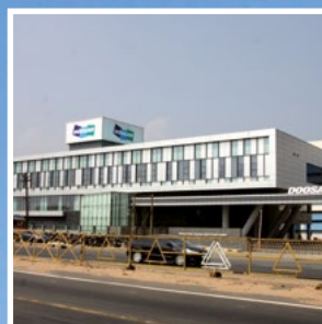
Doosan Chennai, India