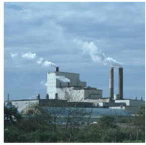
Honshu Paper, Japan 126 MW th