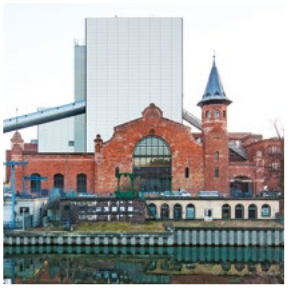
Berlin, Germany 242 MW th