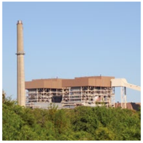
Twin Oaks, USA 2 x 474 MW th