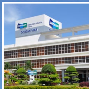
Doosan Vina, Vietnam