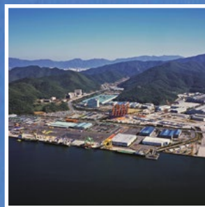
Doosan Headquarters, Changwon, Korea