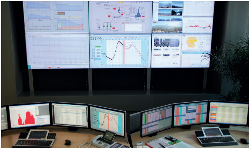
New clarity at TIWAG in Tirol, Austria

The Tiroler TIWAG AG provides safe and environmentally sound energy supplies at competitive prices. TIWAG also creates jobs, value and industrial development in its home market, contributing to the securing of positive economic and social living conditions for the next generation. In order to continually ensure a safe, inexpensive