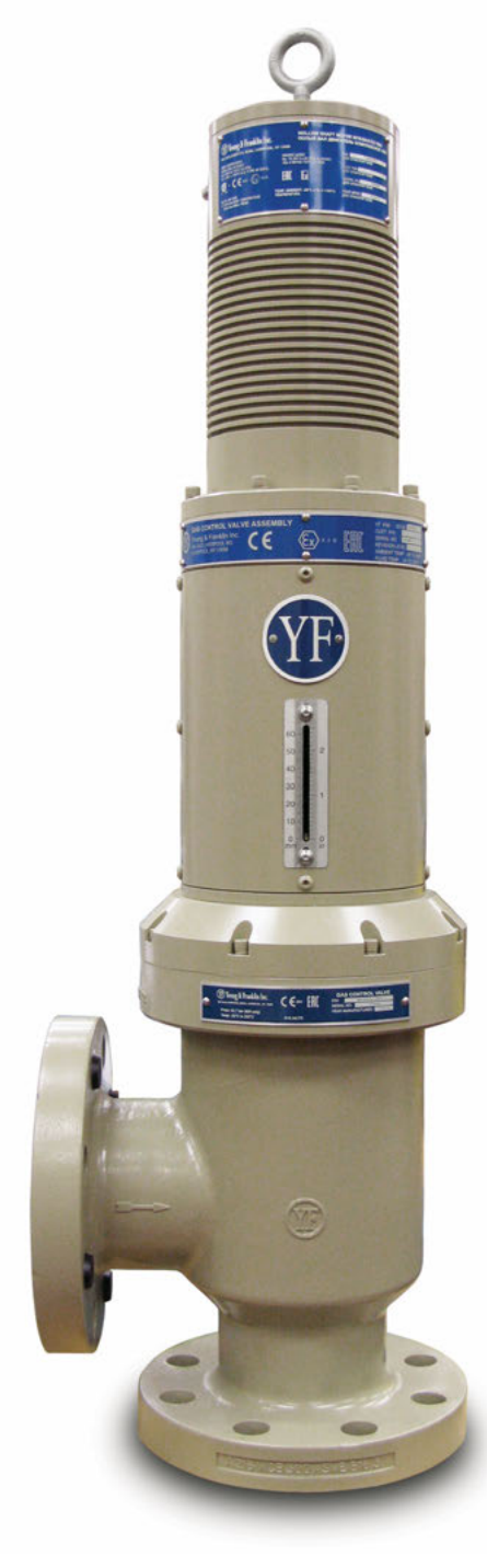
3010 Series Choked Flow Electromechanically Actuated (EMA) Gas Control Valve (3")