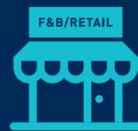
Rocku Yakiniku Restaurant