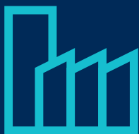
Lafarge Antara Steel