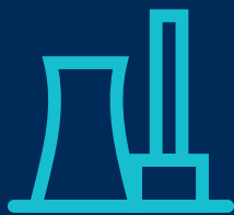
Linde Talin Powerstation