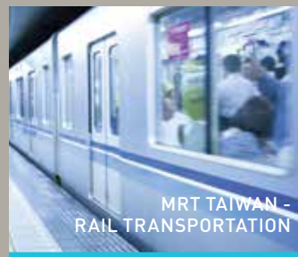
MRT TAIWAN - RAIL TRANSPORTATION