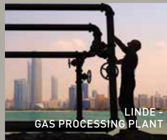
LINDE - GAS PROCESSING PLANT