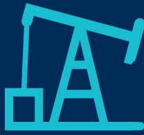
Kerteh, Terengganu RAPID, Johor