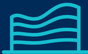
1 Mont Kiara Shopping Mall