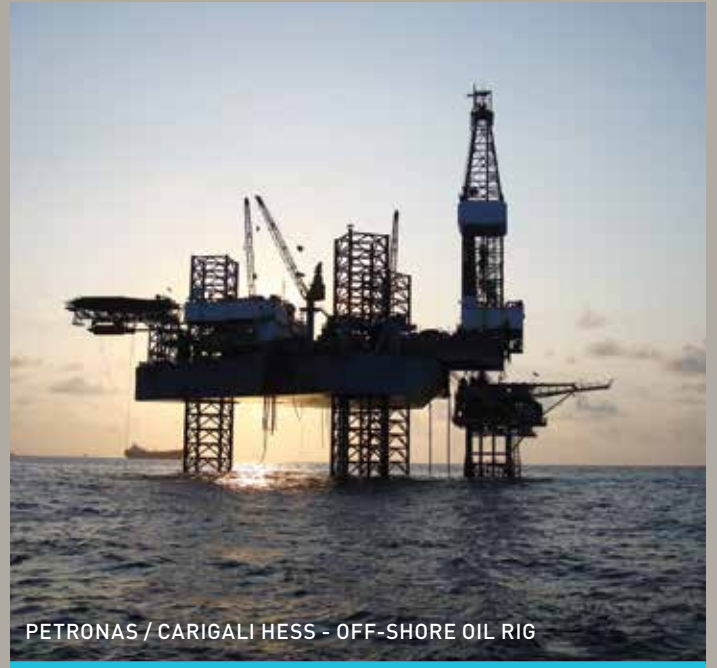
PETRONAS / CARIGALI HESS - OFF-SHORE OIL RIG