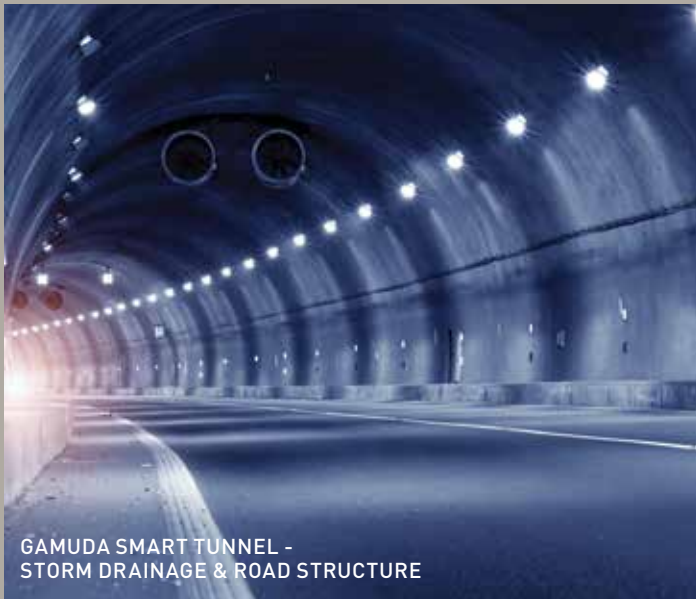
GAMUDA SMART TUNNEL - STORM DRAINAGE & ROAD STRUCTURE