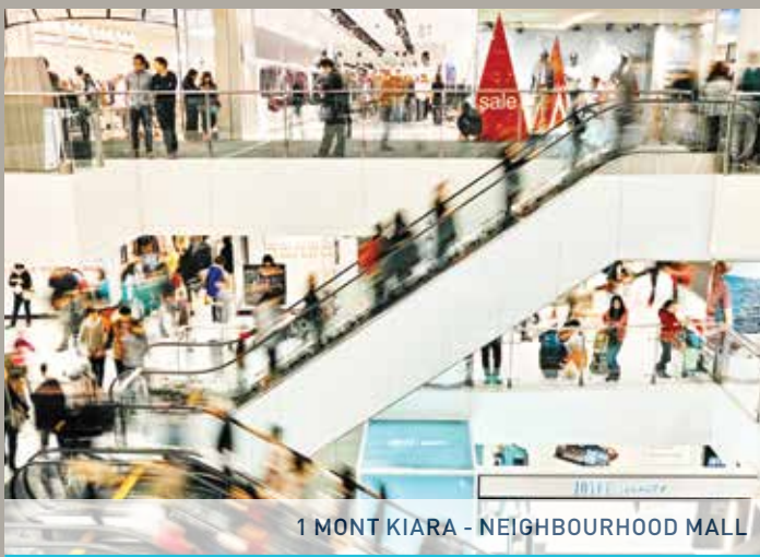
1 MONT KIARA - NEIGHBOURHOOD MALL