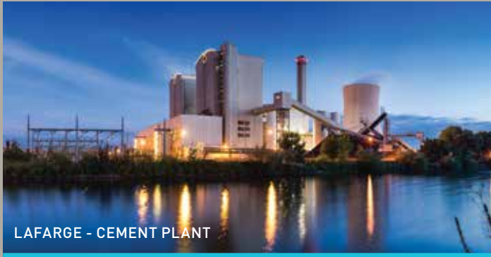
LAFARGE - CEMENT PLANT