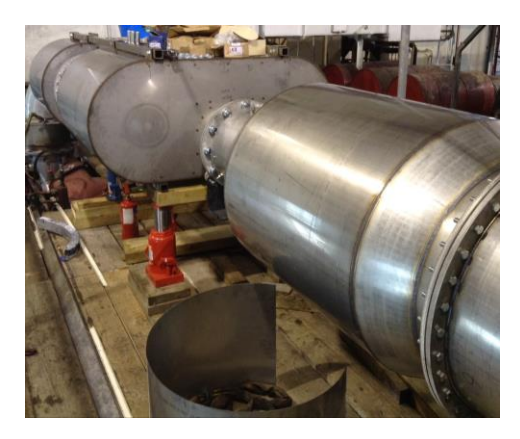
Exhaust During Installation'

This company was ideally suited to the task since they were familiar with Thames Water's requirements in terms of site safety etc and had employees with a range of skills including electrical. In addition, they had sufficient manpower and equipment to move large and heavy items.