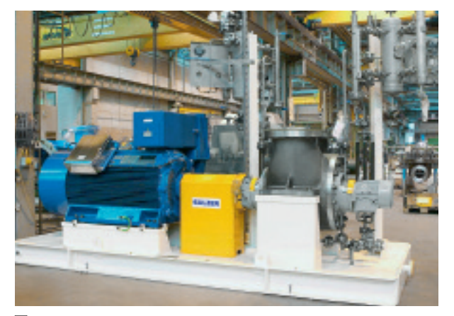
1 BBS pumps for heat transfer fluid circulation main.