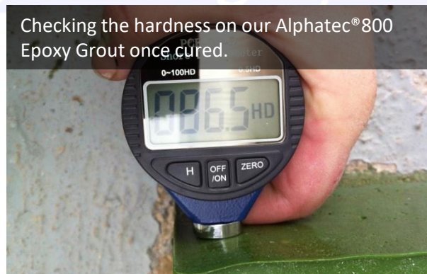
Checking the hardness on our Alphatec® 800 Epoxy Grout once cured.

The quantity of material removed was sufficient to ensure a proper levelled surface with healthy concrete, and not enough to change in any way the position of the saddle.