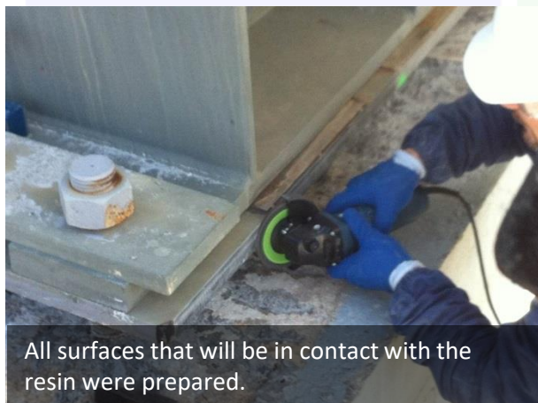
All surfaces that will be in contact with the resin were prepared.

The repairs (for both tanks working on parallel and for all the footings: six in total) were carried out to restore the integrity of the interface between the grout and the sliding plates, situated beneath the footings.