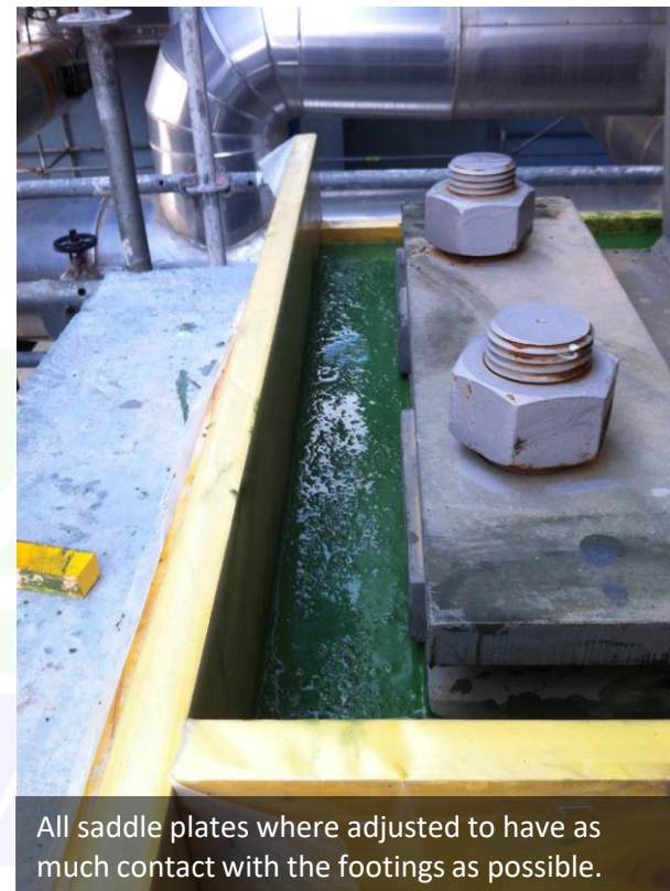
All saddle plates were adjusted to have as much contact with the footings as possible.

Finishing of all grouted areas was revised to avoid sharp edges and After taking off the pressure on the Alphapads®, the whole of the tank weight rested on the epoxy grout.