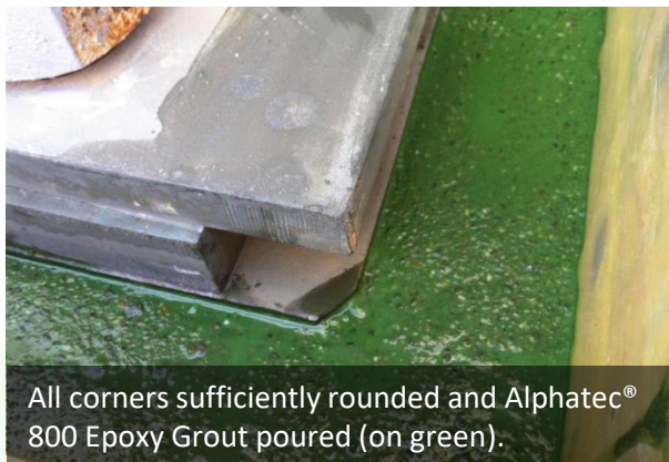
All corners sufficiently rounded and Alphatec® 800 Epoxy Grout poured (on green).

Using pneumatic chippers, we got rid of enough material from underneath the sliding plate to be able to place the first Alphapad® sized D2.