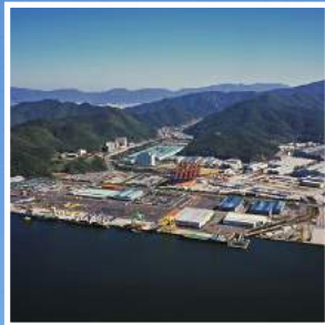
Doosan Headquarters, Changwon, Korea