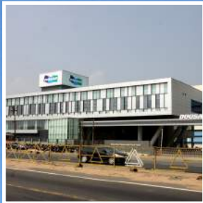
Doosan Chennai, India