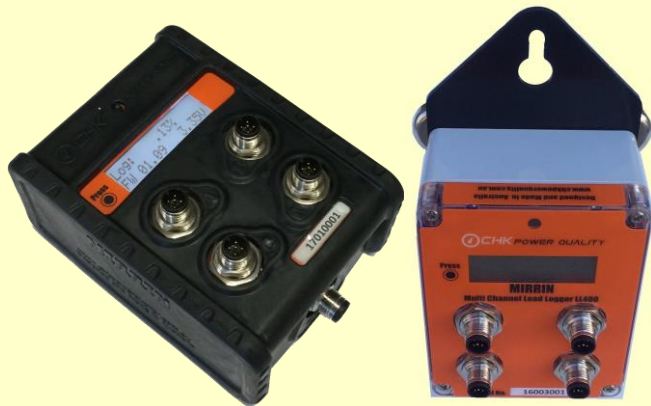
Figure 1: MIRRIN with holster (left), MIRRIN with back plate and magnetic feet mounting (right)

The MIRRIN Multi-Channel Battery Operated Load Logger (MLL) measures AC RMS current (load) up to four channels and is ideal for monitoring loads on circuits and switchboards to record load profiles and used to identify slow changing events such as long duration interruptions, outages and derive estimates of usage patterns.