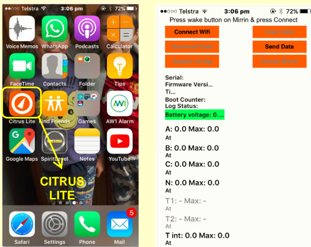
Figure 4: CITRUS LITE: (a) Installed on iOS, (b) Launched